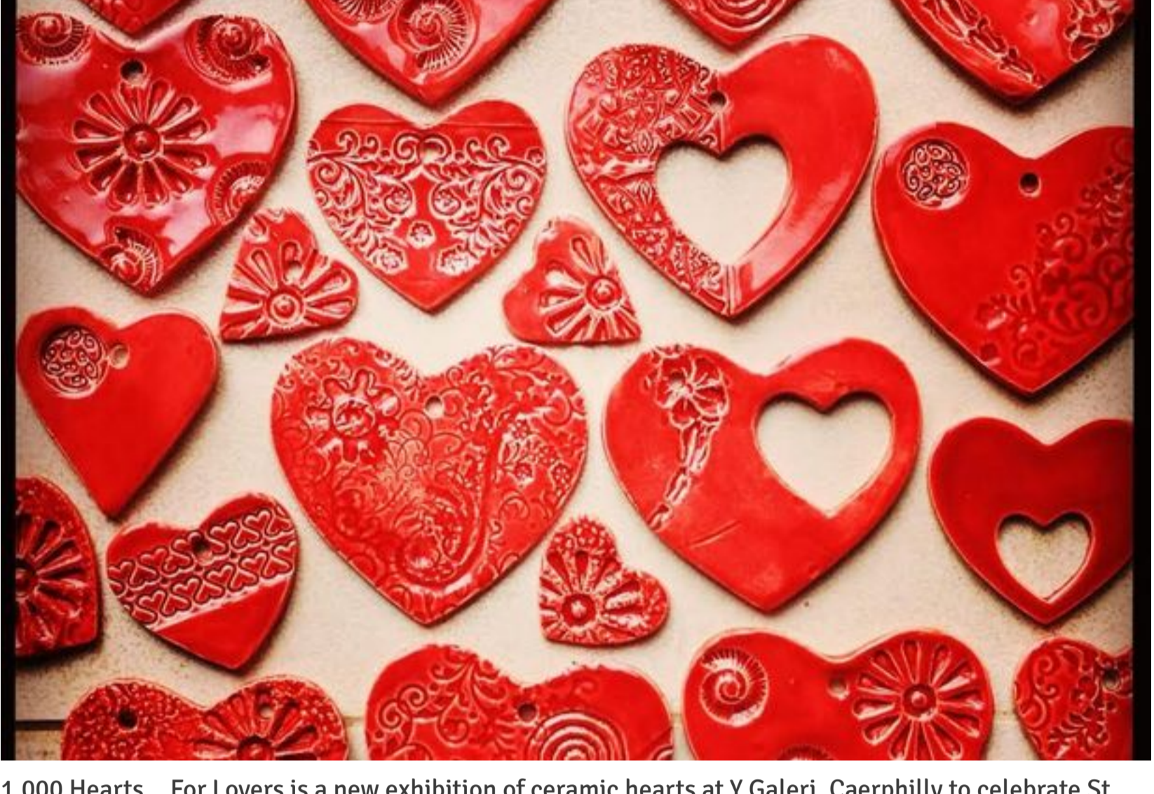
1,000 Hearts... For Lovers is a new exhibition of ceramic hearts at Y Galeri, Caerphilly to celebrate St Dwynwen's Day

Could there be a more romantic way of celebrating St Dwynwen's Day than by filling an art gallery with 1,000 ceramic hearts?